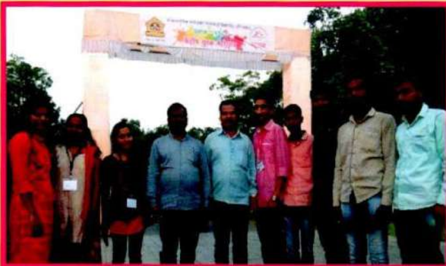
केंद्रीय युवक महोत्सव - सहभागी गांधी महाविद्यालयाचा संघ