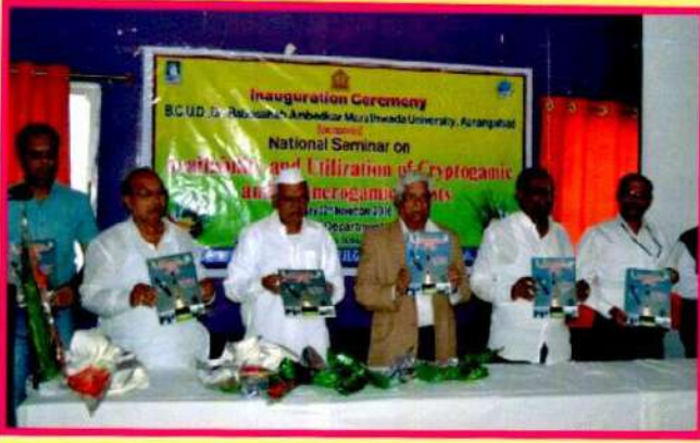
अमोलक अंकाचे प्रकाशन