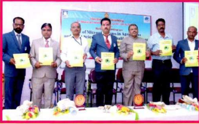
वनस्पतीशास्त्र परिषदेत शोध निबंध प्रकाशन