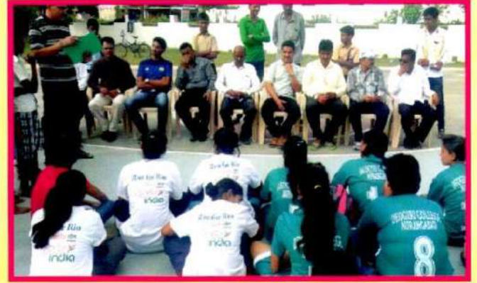
डॉ.बा.आं.म.वि.ओं. अंतरगत बास्केटबॉल स्पर्धा