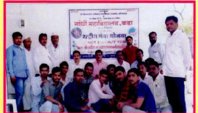
राष्ट्रीय सेवा योजना शिबीर