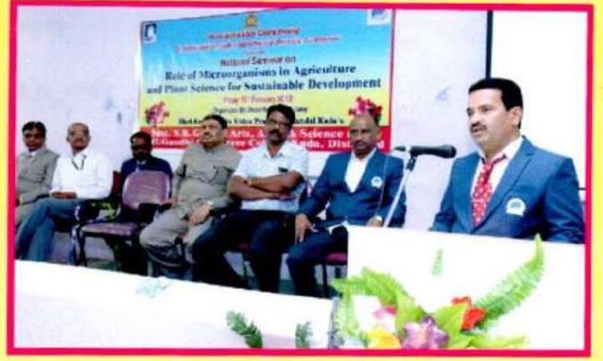
वनस्पतीशास्त्र विषयाचे राष्ट्रीय परिषद