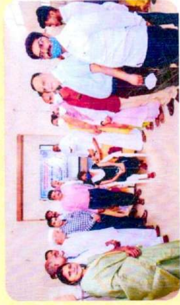
महाविद्यालयामध्ये एन.एस.एस. अंतर्गत कोव्हीड-19 लसीकरण कार्यक्रमाला सहभागी संस्थेचे सन्माननिय पदाधिकारी, प्राध्यापक व विद्यार्थी