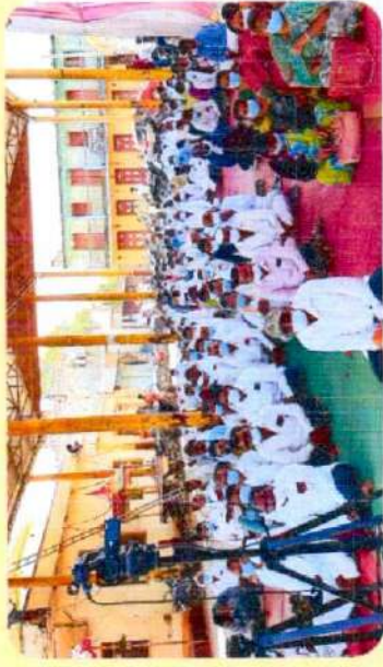
डॉलीव पिक परिसंवादामध्ये सहभागी आलेले शेतकरी