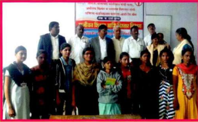
विद्यार्थी समुपदेशन शिबीर समारोप