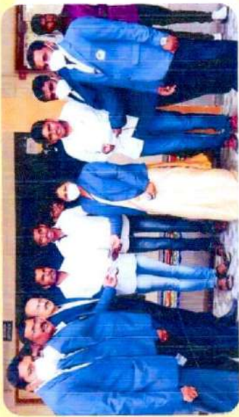
महाविद्यालयातील विद्यार्थ्यांना कोव्हीड प्रतिबंधक मारूक वाटप करताना महाविद्यालयाचे प्राचार्य व प्राध्यापक वृंद