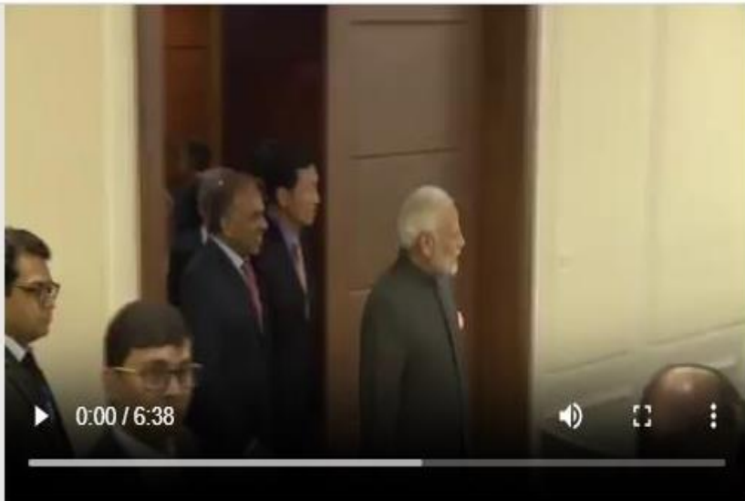
Glimpse of Singapore India Hackathon