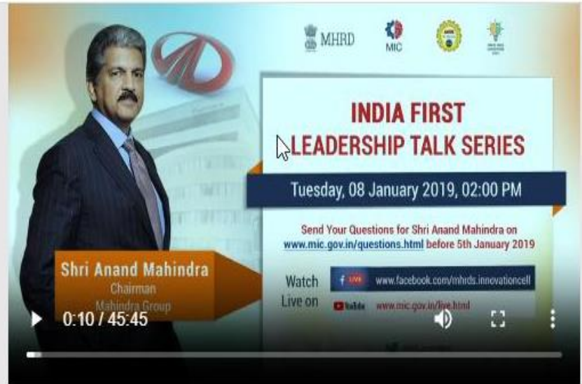
India First Leadership Talk with Shri. Anand Mahindra