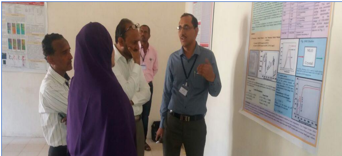
“Measurement of Earth Resistance as a Precursor of Earthquake” at BAMU Aurangabad.