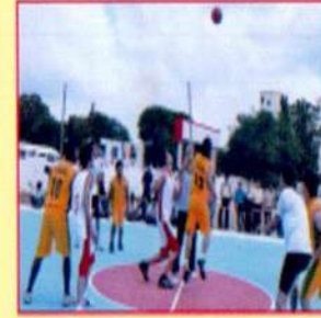
बास्केटबॉल खेळाला सुरुवात करणे