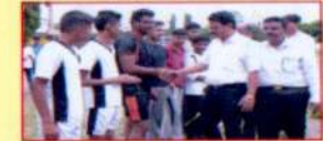
दि. २९/८/२०१७ रोजी महाविद्यालय महाराष्ट्र कुटुंबीन अर्थीन सुरुवाती विद्यार्थी कुटुंबीन खेळाचे.केळी आ.भे.स.सी. व आ.भे.स.सी. वर