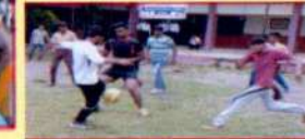
दि. २९/८/२०१७ रोजी महाविद्यालय विद्यार्थी कुटुंबीन खेळाचे.केळी.