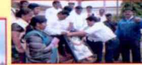
दि. २९/८/२०१७ रोजी महाविद्यालय महाराष्ट्र कुटुंबीन विभाग १ विभाग अंतर्गत उद्घाटन करणे केळी सभ्यात घडणे वर