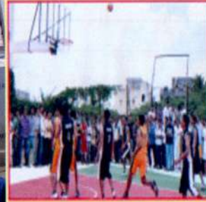
बास्केटबॉल खेळाला सुरुवात करणे