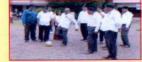
दि. २९/८/२०१७ रोजी महाविद्यालय महाराष्ट्र कुटुंबीन विभाग १ विभाग अंतर्गत आ.भे.स.सी. वर कुटुंबीन खेळाची सुरुवात करणे.केळी.